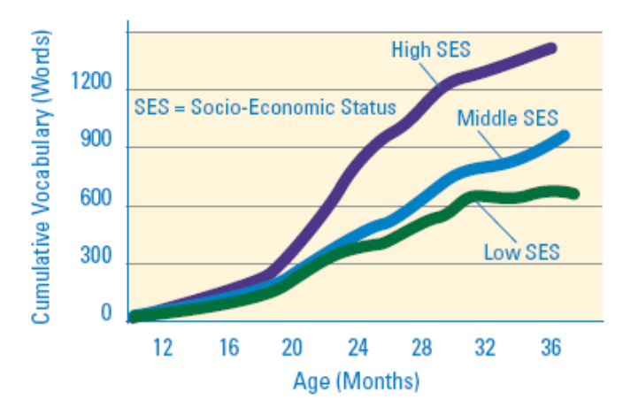
Figure 2. Inequality in linguistic development has its roots in early life and then accumulates, widening the gap between the poor and the wealthy

These findings show that ECD is a critical period for the lifespan development of every individual and that inequality over the lifecourse – both in terms of socio-economic indicators and health – is largely determined by ECD. Therefore, any strategy aiming at reducing socio-economic and health inequality would require specific focus and interventions on improving ECD outcomes and reducing the substantial inequalities that are observed and start to accumulate from this key period.